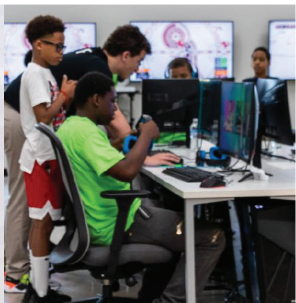
BGCSM members engage in the Esports + Hockey program