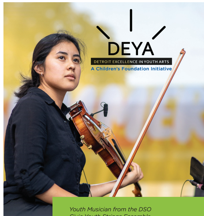
Youth Musician from the DSO Civic Youth Strings Ensemble.

On August 5, DEYA produced a youth stage at the Concert of Colors; the first ever in the Concert's 29-year history. The DEYA Youth Stage took place outdoors at the Detroit Symphony Orchestra's Sosnick Court. Performances included featured poetry from InsideOut Literary Arts Project's Citywide Poets, youth drummers and dancers of Heritage Works performing in the West African tradition, the teen Mosaic Singers from Mosaic Youth Theatre of Detroit, a youth string quartet from the DSO's Civic Youth Ensembles, as well as the winners of the first-ever DEYA Launch Awards for solo performance. The Concert of Colors DEYA Youth Stage was generously funded by the Skillman Foundation, with additional support from the Children's Foundation, the DSO and the Motown Museum.