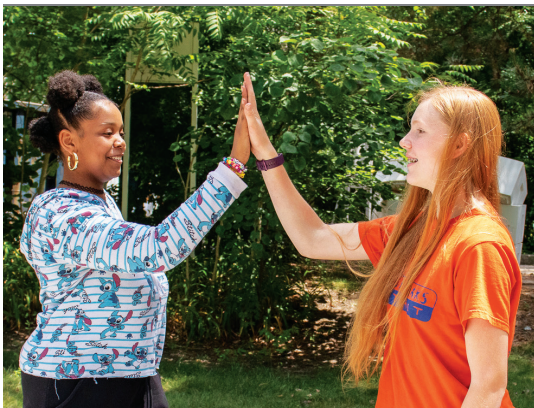
Students at The School at Marygrove help build Big Green learning gardens