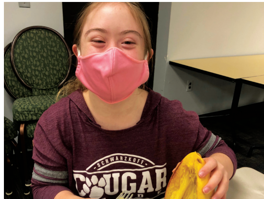
KOTG participant discovers cooking with squash

That's why, with $47,500 in grant support from The Children's Foundation, Big Green has partnered with The School at Marygrove to build a learning garden, farm and student-led farmer's market. The Learning Garden will implement edible education programming to over 300 students throughout the school day and during after-school programming. In addition, the farm will provide nutrition programming into Detroit's Livernois-McNichols neighborhood and impact the community's access to healthy, local food.